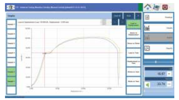
Graph comparison, superimpose of batch sample tests with Graph zooming and point tracing facility.