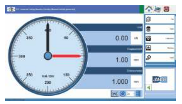
Displays values of load, displacement & extension with dial for displaying load.