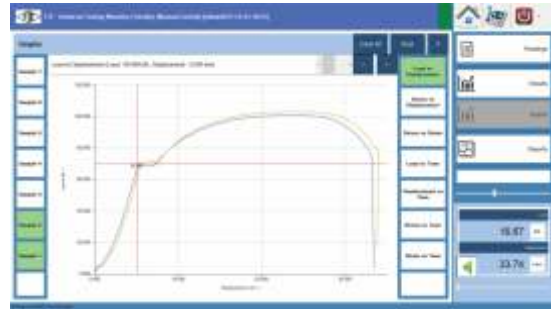
Graph superimpose, Comparison & point tracing

Graph comparison, superimpose of batch sample tests with Graph zooming and point tracing facility.