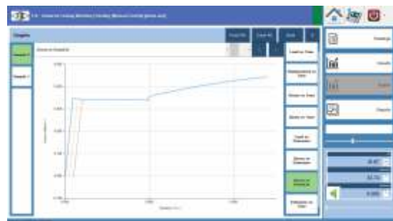
Load Vs Extension

Displays graph for extensometer readings against load with proof lines for proof stress.