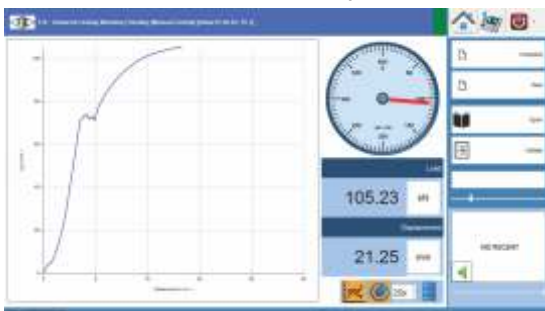
Real Time Graph

Real time values of load and displacement / extension used for plotting its graph & can be seen real time during testing & facility to convert the units simultaneously.