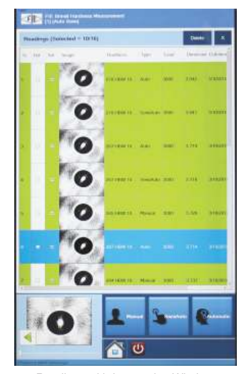
Readings with Impression Window

FIE reserves the right to change the specifications without notice due to constant improvement in design.