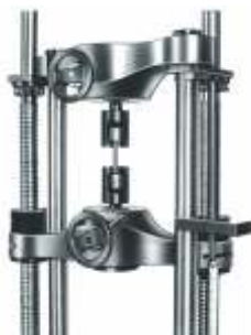
Attachment for Tension Test of - Shouldered & Threaded specimens upto M6 to M20 (Min. length 110 mm).