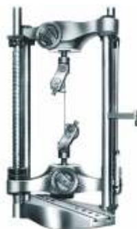
Attachment for Tension Test of - Wire Ropes (Min. Ø1 to Ø10mm)