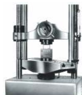
Shear Test (Min. Ø5 to Ø40mm)